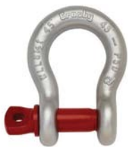
G-209 / S-209

G-209 Screw pin anchor shackles meet the performance requirements of Federal Specification RR-C-271F Type IVA, Grade A, Class 2, except for those provisions required of the contractor. For additional information, see page 426.