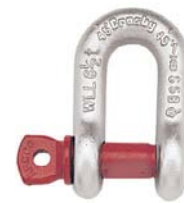
G-210 / S-210

G-210 Screw pin chain shackles meet the performance requirements of Federal Specification RR-C-271F, Type IVB, Grade A, Class 2, except for those provisions required of the contractor. For additional information, see page 426.